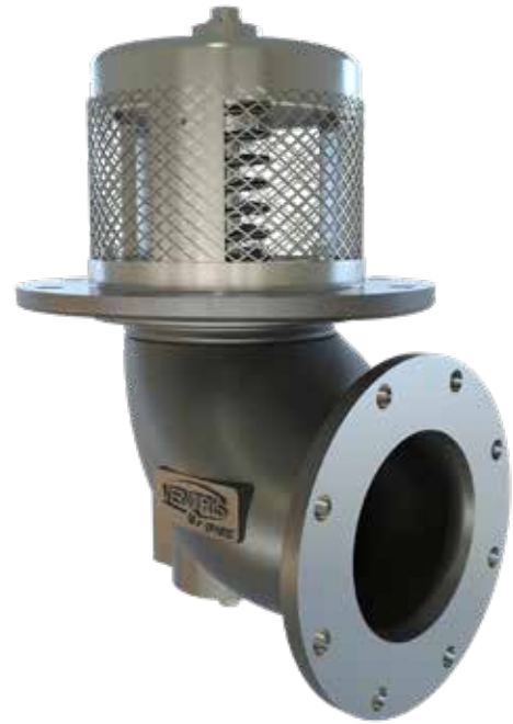
Ventris Internal Valve VEV100 (Low-profile Euro-100 Style)